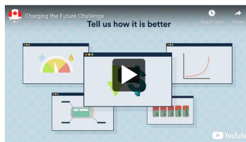
Charging the Future Challenge video

Six prize-based Clean Technology Challenges cviii were advanced under the Impact Canada Initiative , cix including Charging the Future , cx a $4.5 million challenge announced in July 2019, aimed at accelerating made-in-Canada battery innovation. Finalists of all six challenges have been announced, with funding agreements in place for all 43 finalists.