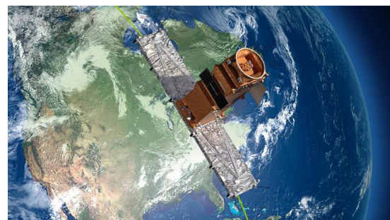
Canada's RADARSAT Constellation Mission provides essential imagery to guide emergency flood response and safeguard critical energy and transportation corridors.

We launched the virtual Canadian Centre for Energy Information , lxi an independent, one-stop shop for comprehensive energy data and expert analysis, which will ensure individuals and communities have the most reliable, transparent and science-based information, as the evidence base for making informed decisions. Additionally, we invested in the Building Regional Adaptation Capacity and Expertise Program (BRACE) lxii and the Adapting to Climate Change Program . lxiii By providing access to government science, these programs aim to increase the capacity of small to medium sized enterprises, organizations, professionals and communities to better adapt to climate change. We also contributed successful delivery of Canada's national climate change adaptation conference, Adaptation Canada 2020 , lxiv which covered a breadth of topics and showcased a range of adaptation solutions to climate change impacts such as sea level rise, flooding and permafrost thaw.