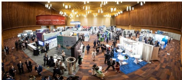
10th Clean Energy Ministerial Meeting / 4th Mission Innovation Meeting, Vancouver Convention Centre West

Ten companies xxiv were selected in January 2020 under BESC and announced in February at GLOBE 2020 . xxv We also hosted the 4th Mission Innovation xxvi and 10th Clean Energy Ministerial Meetings (CEM-MI) xxvii in May 2019, leading the way to clean technology research and policies.