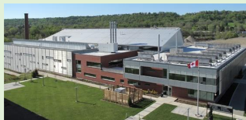
CanmetMaterials' main facility is located in Hamilton, Ontario.