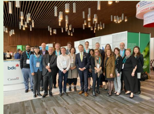
Minister O'Regan with the 10 BESC finalists and NRCan staff at GLOBE 2020, February 2020

Breakthrough Energy Ventures (BEV) and the Business Development Bank of Canada (BDC) have each committed up to $10 million in follow-on funding. BESC leverages NRCan's technical expertise and funding as well as business development and investment support from BEV and BDC.