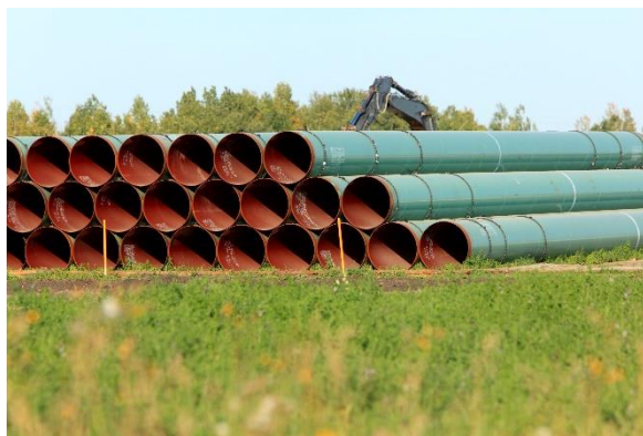
Stack of pipe sections ready for laying pipeline across prairie land

NRCan continued to support partnerships with Indigenous peoples through the Indigenous Advisory and Monitoring Committees (IAMC) for TMX and Line 3 Replacement. The two IAMCs delivered over $8.5 million in contribution funding, including support for two ground-breaking monitoring initiatives that facilitated Indigenous participation in the monitoring and oversight of regulatory activities for the projects. NRCan also promoted opportunities and economic development through the Indigenous Natural Resource Partnership program cxlv which aims to increase Indigenous economic participation in infrastructure projects that have a