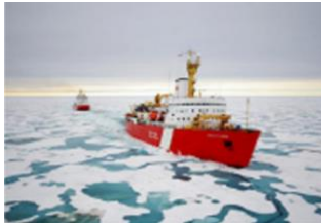
The CCGS Louis S St-Laurent (foreground) and the CCGS Terry Fox (following). A decade of research surveys were conducted from icebreakers to acquire geological and geophysical data to define Canada's continental shelf in the Arctic Ocean.

NRCan finalized Canada's Arctic Ocean submission to the Commission on the Limits of the Continental Shelf . lxx Canada filed the submission at the United Nations . lxxi in May, 2019. The submission defines Canada's continental shelf in the Arctic Ocean, with the outer limits encompassing an area of over one million km 2 , including the geographic North Pole. International recognition of the outer limits will make this Canada's last international boundary, conferring sovereignty over the natural resources on the seafloor and in the subsoil. It is expected that Canada will make its formal presentation on the Arctic Ocean submission at United Nations Headquarters in New York in 2021.