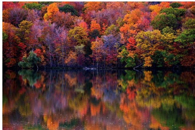
Colorful Canadian fall in Mont-Saint-Bruno National Park, Quebec

Canada has 347 million square kilometers of forests, the monitoring of which is only feasible from space. NRCan is committed to using state-of-the-art remote sensing technologies to provide information in near real-time manner. This allows for timelier decision-making by wildfire managers to protect people and property. As new science and technologies emerge, NRCan upgrades its existing tools and develops new ones towards meeting this objective. In 2019-20, two enhanced wildfire monitoring tools using remotely sensed information were used by wildfire managers to support their planning and operational decision-making. This builds on a trend of developing two enhanced tools using remotely sensed information each year for the past three years and is above the target of one tool per year. NRCan continues to use science to minimise the risk to Canadians and their property due to wildfires. In 2019-20, the Department provided federal leadership for the implementation of the Canadian Wildland Fire Strategy (CWFS) lxxxvi by prioritising research topics, identifying gaps and identifying critical science questions. NRCan commenced work on the Wildland Fire Component of the EMS under the themes: (i) Supporting Resilient Communities; and (ii) Enhanced Response to Wildland Fires. Research on wildland