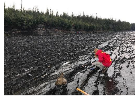
A researcher studies black shales on the Peel River in central Yukon. These shales can contain nickel, zinc, molybdenum, and gold.

To improve exploration investments in the Arctic and inform land use decisions within northern communities, NRCan modernized geo-mapping and advanced knowledge of geoscience in the north through the Geo-mapping for Energy and Minerals Program (GEM). clxix This program created the first digital maps of Canada's North, and presented research results to government and industry stakeholders and to Northern and Indigenous communities. GEM developed a comprehensive geoscientific framework that will be available through a web portal when launched later in 2020. NRCan also provided geoscience data to industry to support mineral exploration, through the Targeted Geoscience Initiative , clxx which focused on deeply buried mineral deposits.