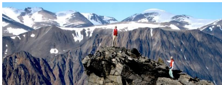
Geologists from GEM's Multiple Metals Cumberland Peninsula Project examine an 1860 million-year-old mountain building event on Eastern Baffin Island, Nunavut (2009).